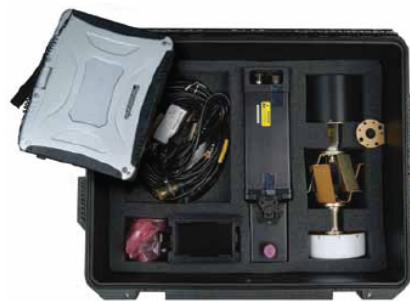
Optional C-Band Directional Antenna